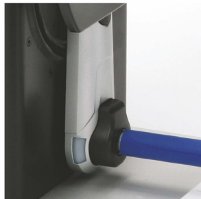
Colored LED indicator provides rewriter operation status