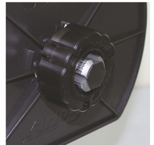
Easy assembly lock module for quickly and firmly label roll holding